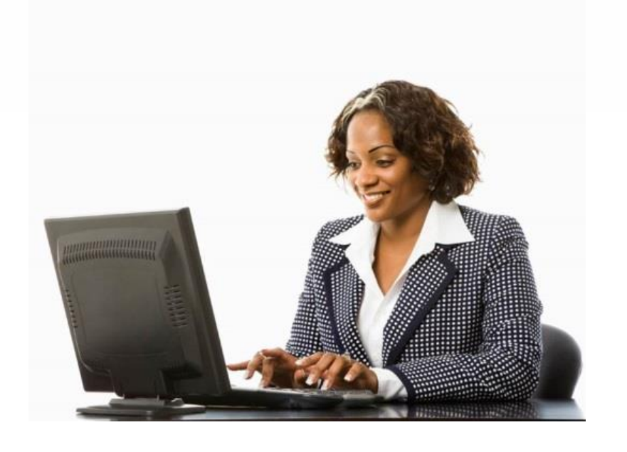
Online Secure Payroll