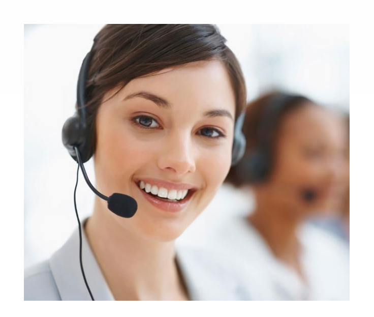
CDC+ Customer Service